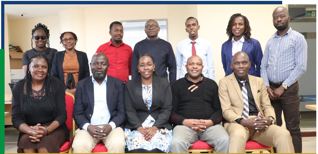
HRMPEB staff during the Public Procurement Regulation Authority training on 22nd August 2023