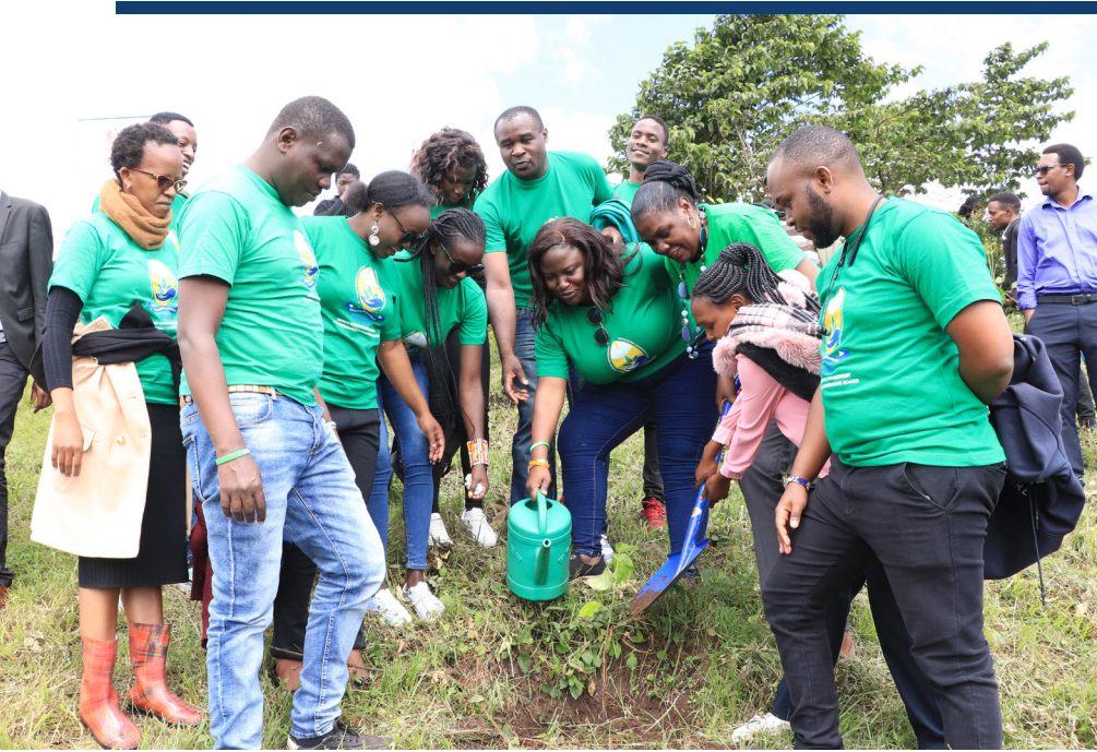
HRMPEB staff during a CSR planting trees exercise at Lekuruki Ngong Forest